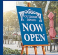
Foam Board Signs