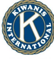
Volunteer Organization of the Year Kiwanis