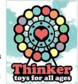
Small Business of the Year Thinker Toys

It is important that you fill out this form as completely as possible, as this information determines the qualifications of the Nominee. You may attach extra sheets, as necessary. Please keep your nomination confidential until winners are notified.