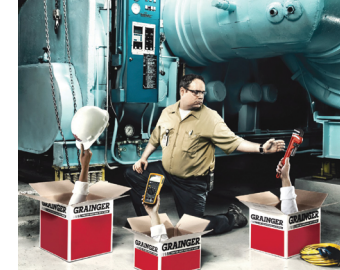
Visit www.grainger.com/entegra for more product and services information.