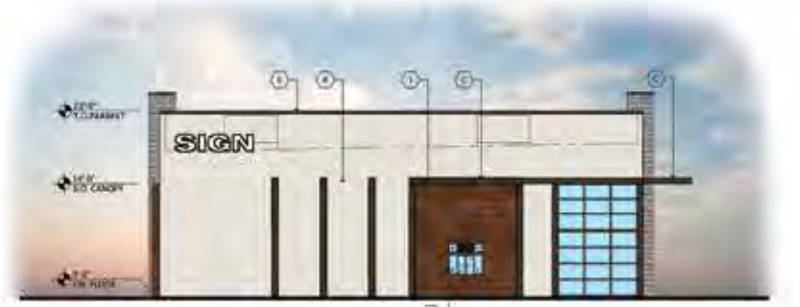
PAD 1A - NORTH ELEVATION SCALE: 1/8"=1'-0"

OVERALL SITE PLAN 27.43-ACRE MIXED-USE DEVELOPMENT