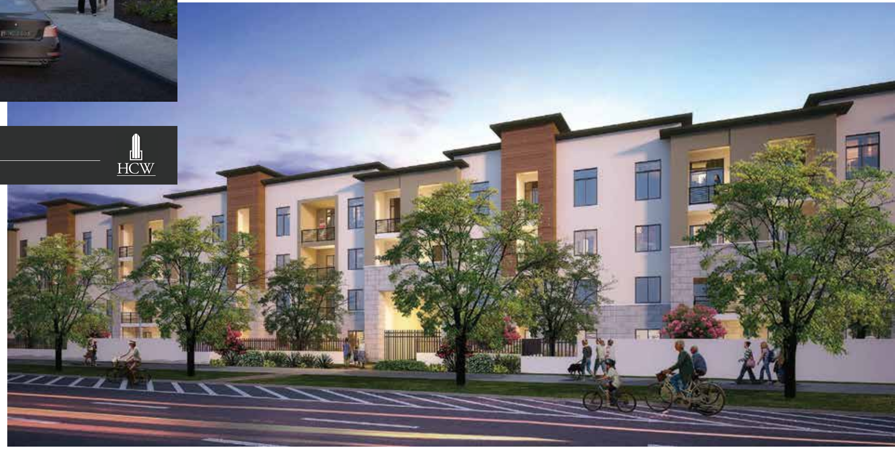
4 STORY LUXURY APARTMENT DEVELOPMENT RENDERING

MARTI WEINSTEIN Cell: 224.612.2332 marti@dpcrc.com