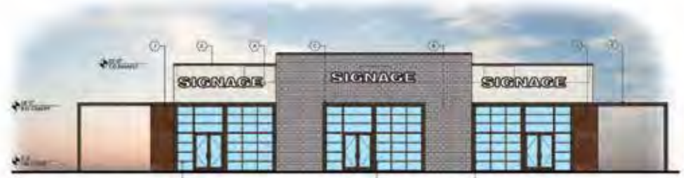
PAD 1A - WEST ELEVATION SCALE: 1/8"=1'-0"