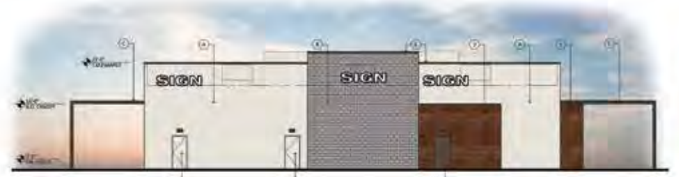
PAD 1A - EAST ELEVATION SCALE: 1/8"=1'-0"