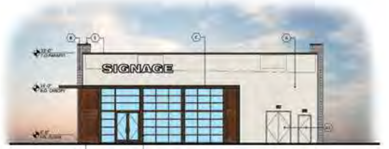
PAD 1A - SOUTH ELEVATION SCALE: 1/8"=1'-0"