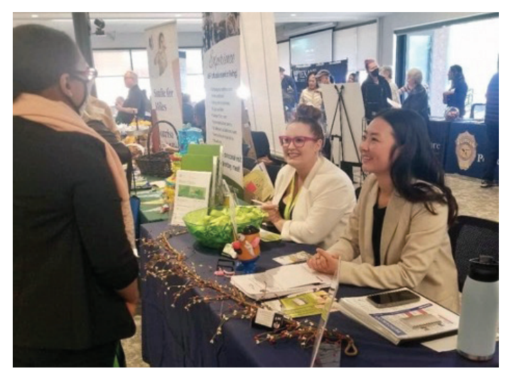
The Chamber's HEALTH & WELLNESS EXPO returned in person with amazing feedback and energy from more than 150 attendees.

Our Ambassadors hosted 18 RIBBON CUTTINGS and introduced business anniversary celebration events for returning members.