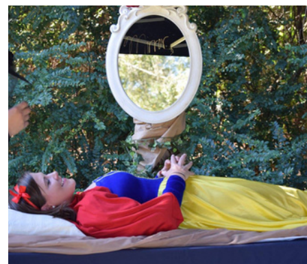
Snow White Theme