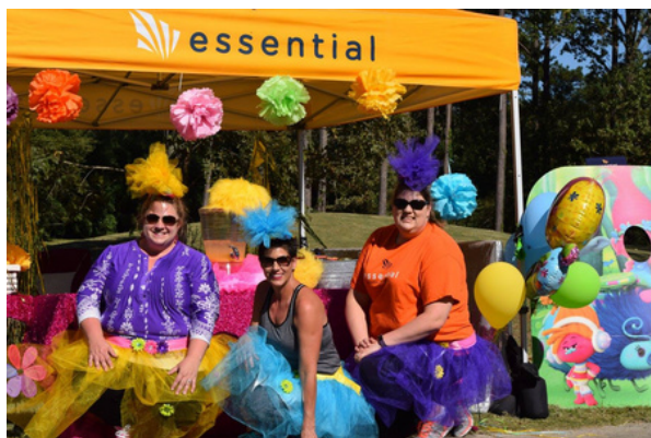
Essential - Winner Best Decor