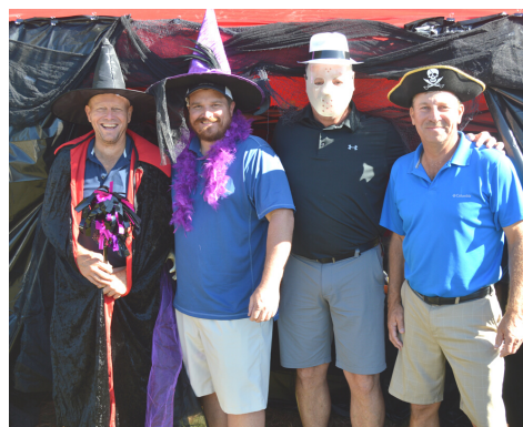
Best Party Team - Blount Gen.