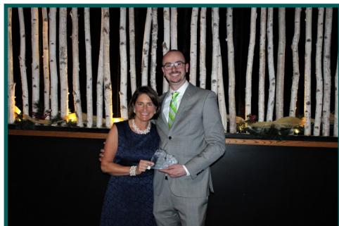
Business of the Year: