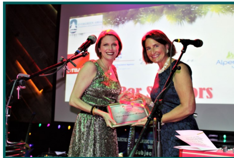
People's Choice of the Year: