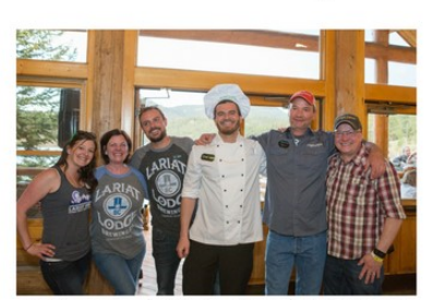
ıst Place: Lariat Lodge Brewing Company