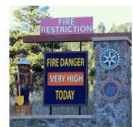
Smokey the Bear - another local project funded by Evergreen Rotary Club