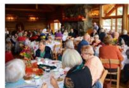
The Annual Thanksgiving Luncheon - Rotary's gift to the Community