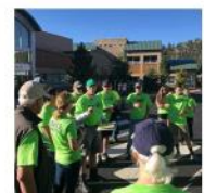
Our volunteers getting ready for the big Recycle day