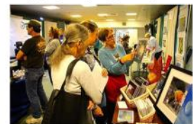
The Foothills Home, Garden & Lifestyle Show March 30/31 at EHS will be our 14th year