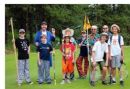
100 Holes of Golf: Raising funds for non-profits, and having a lot of fun doing it!