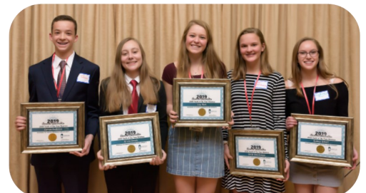
Youth of the Year Nominees