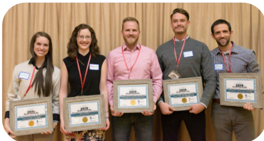
Young Professional of the Year Nominees