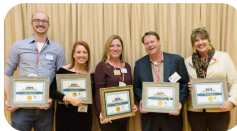
Ambassador of the Year Nominees