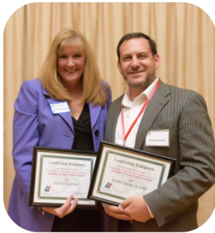
Leader of the Year Nominees