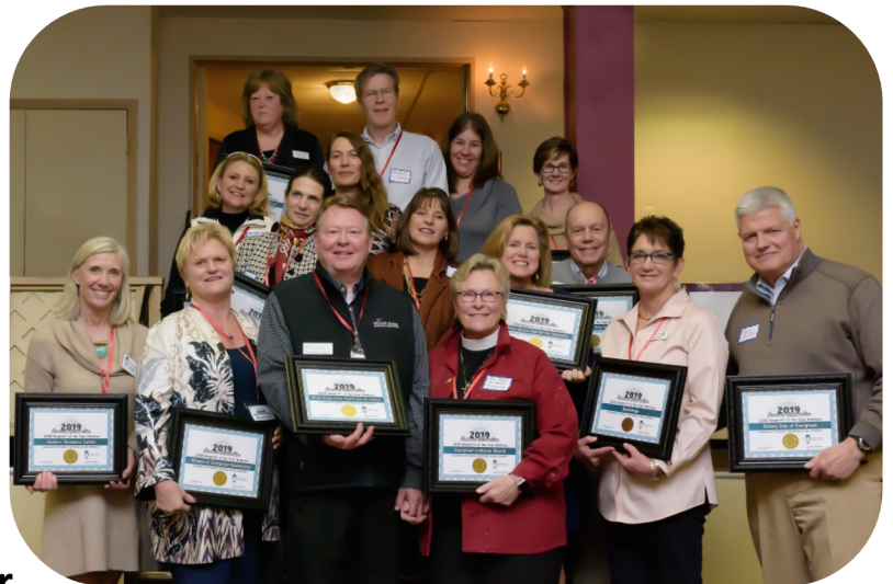
Nonprofit of the Year Nominees