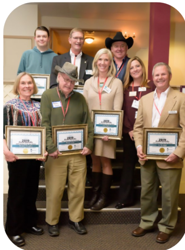
Volunteer of the Year Nominees