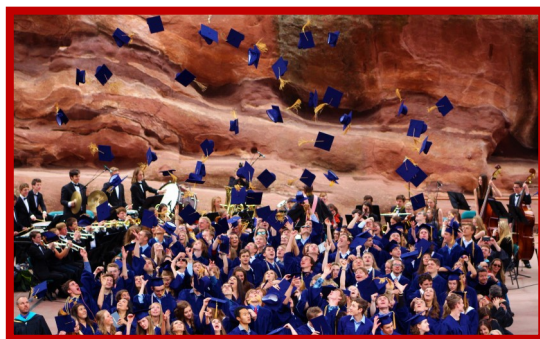
Class of 2019