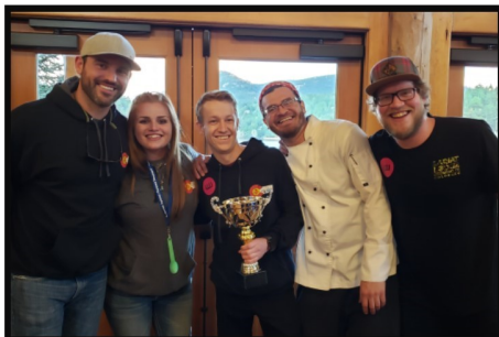
Lariat Lodge Brewing Company Baroque A.F. Vienna Style Lager