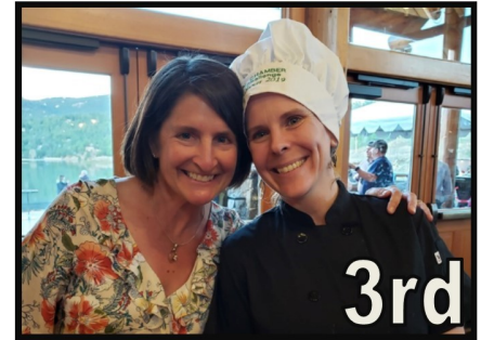
Blackbird Café & Tavern Mini Chicken Pot Pies