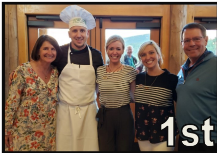
Mount Vernon Canyon Club Ahi Tuna Taco