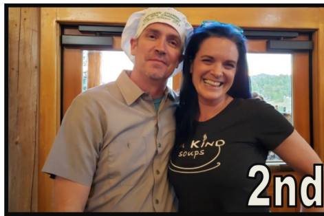
Da Kind Soup Da Kind Soup/Brussel Sprout