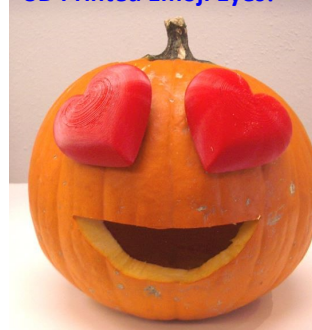
3D Printed Emoji Eyes!