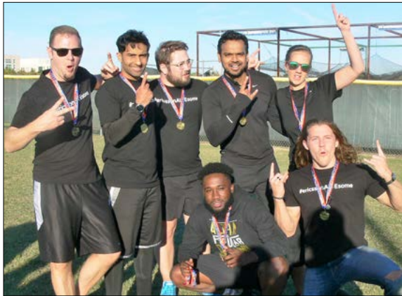
The Ericsson team celebrates their win at the first ever NextGen kickball tournament.

NextGen hosted a kickball tournament with five teams competing at the multi-purpose field at UT Dallas. Team Ericsson outlasted the field to claim the championship ( below ).