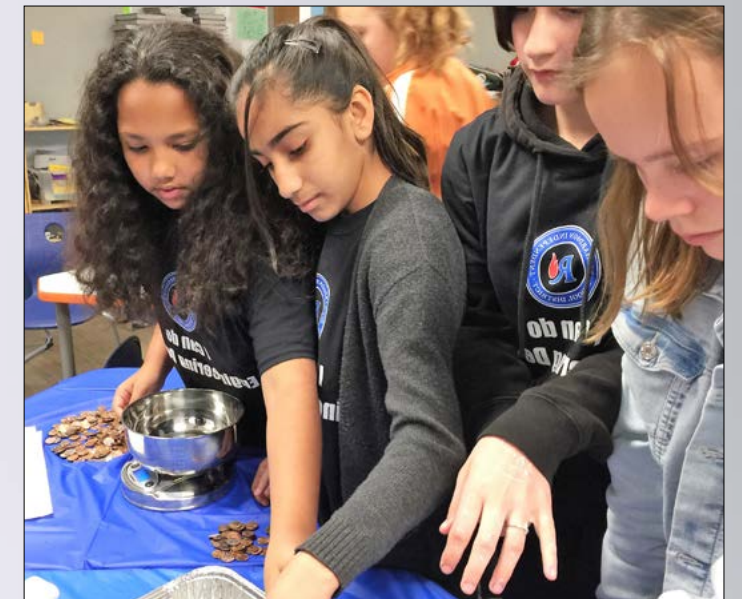
Above: The Tech Titans STEM team continues to develop hands-on-content, providing inspirational experiences for North Texas students.