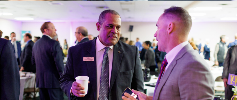
TABLE PARTNER* | $1,200