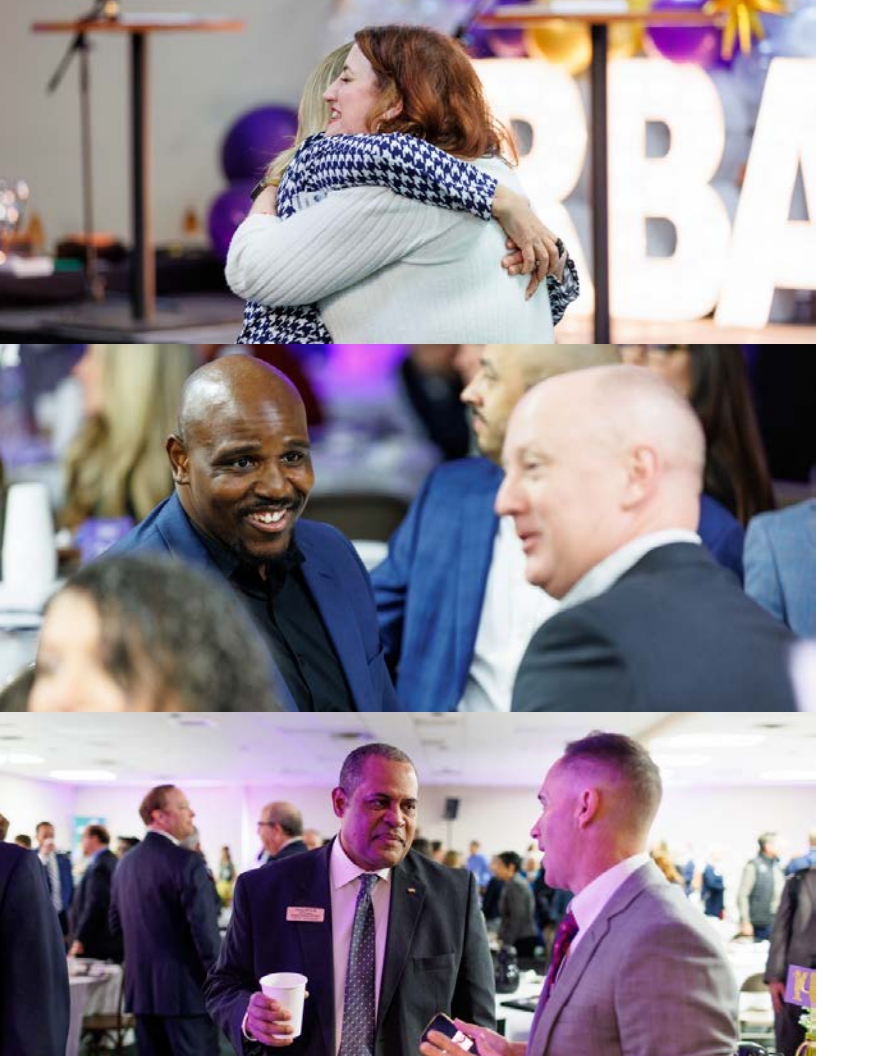
TABLE PARTNER* | $1,200