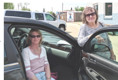
Faith in Action Volunteers

Faith in Action for Cass County connects community volunteers who provide nonmedical, neighborly assistance to seniors, the disabled, and people in need throughout Cass County. With 26.5% of its population aged 65 and better, Cass County sees many people who retire here who don't have nearby family support. Without public transit or even taxi services, people of all ages struggle to get things done if they cannot drive. Many people are on fixed incomes or have mobility problems. Faith in Action volunteers are glad to fill in the gaps in services lacking in our area, even providing an accessible van for people with wheelchairs. In 2019, 123 volunteers assisted 356 people, provided 3,497 rides, contributed 9,800 hours and drove 158,875 miles. They fill about 266 requests each month. We serve people of all ages and have no income restrictions or fees. For more information about Faith in Action community services or volunteer opportunities call 218.675.5435 or email cassfia@uslink.net .