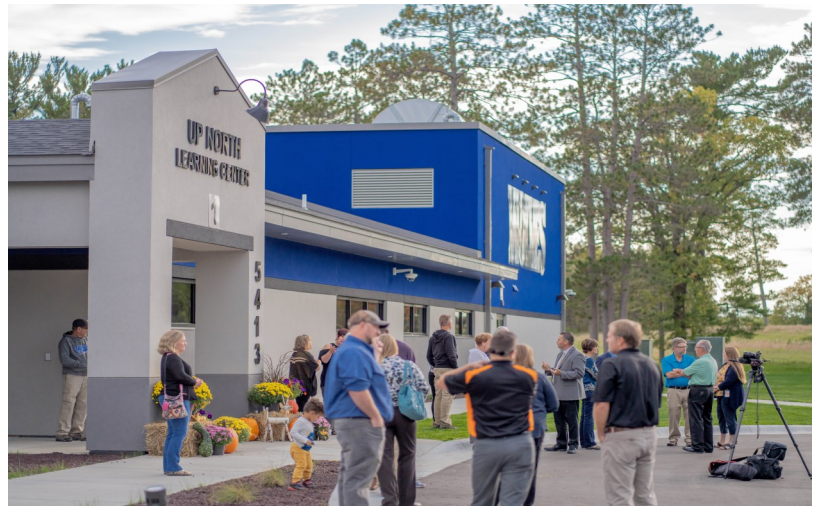
Newly constructed Up North Learning Center on the former Agwachung Campus near Walker supported by Sourcewell.