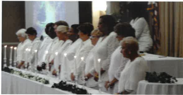
The Necrology Service at the FREA State Conference is always Special.