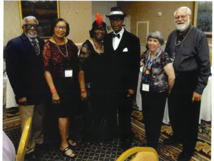
Look at those costumes. We had a great time.