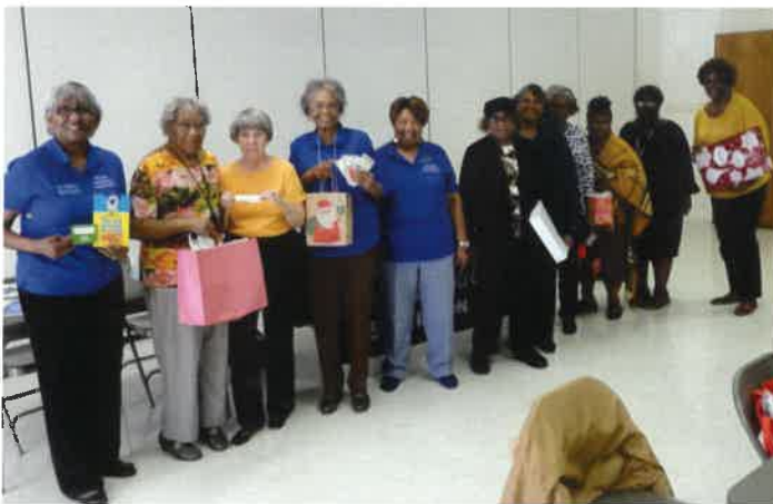
Our January winners celebrate.