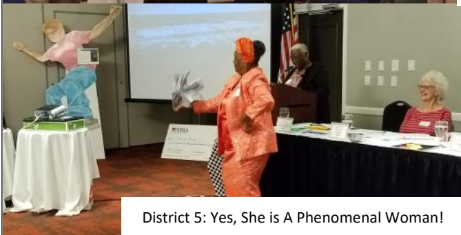
District 5: Yes, She is A Phenomenal Woman!