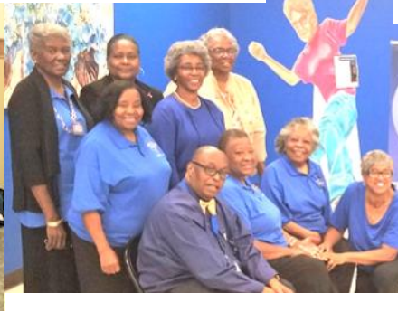
Gadsden REA District 2 - Great job!