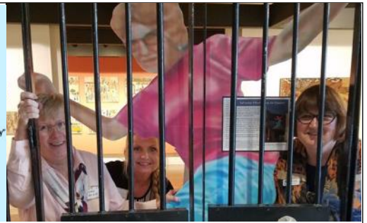
Extreme Ethel strikes again. Honest, we're innocent!