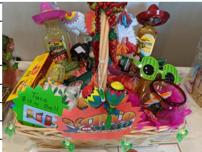
Quirkiest Basket ~ Broward CREA