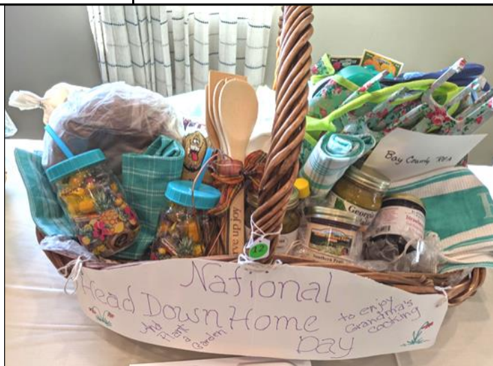
Tastiest Basket ~ Bay CREA