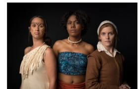
TENACITY: Women in Jamestown and Early Virginia