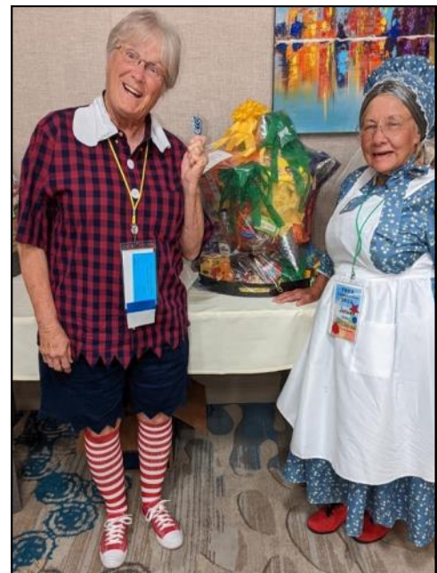
Quirkiest Basket South Pinellas REA