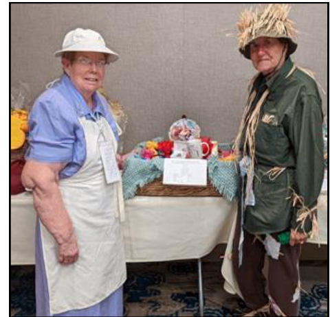
Tastiest Basket Bay CREA