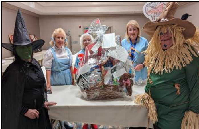
Best Combined 1 Day "Days of" Basket Santa Rosa CREA