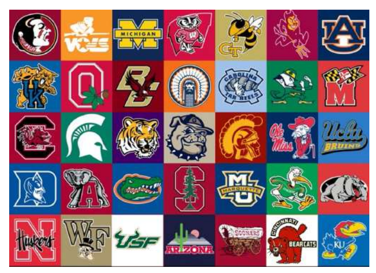
Wear your school colors