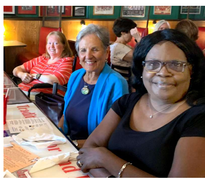
The lunches were delicious, and many retired educators took home enough ample portions for their dinners.