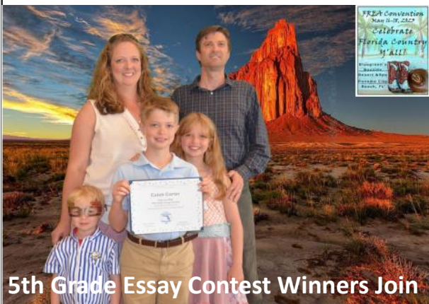
5th Grade Essay Contest Winners Join FREA Members at Convention.