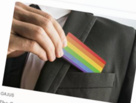
The Greater Houston LGBT Chamber of Commerce is expected to officially launch later this spring.

"As an LGBT business owner, I know a lot of others that are business owners, but we don't connect over business," she added. "This is going to create the infrastructure that's needed to build on."