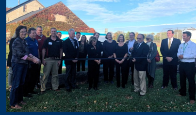
Business After Hours at Peerless Ovens

Currently we have two available Advertising Blocks in our Newsletter. The Cost is $500 for the entire year. You would be able to create your Ad and make changes to the Ad anytime. A good value!