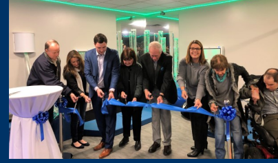
Ability Works Clark Family Sensory Space

If you haven't already RSVP'd for the Trivia & Treats Event please do so before November 18th. Time is running out.