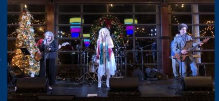
Photos from Holiday Jam 2.0

The Chamber of Commerce's celebrating its 120th Anniversary as well as the 10th year for the Chamber's Signature event, the Taste of the North Coast. This year the Taste of the North Coast event will be held on Thursday, February 20th, 2020 at the New Cedar Point Sports Center. This event is all about enjoying an evening of sampling many different types of foods, beer and wine from chamber-member businesses and others in Erie County and beyond. This is the also the biggest Networking opportunity of the year! If you're interested in reserving a VIP Table please contact me today!