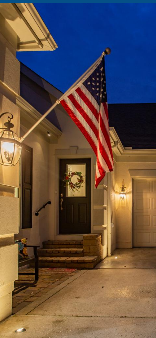
"YOUR ATTITUDE, NOT YOUR APTITUDE, WILL DETERMINE YOUR ALTITUDE." -ZIG ZIGLAR