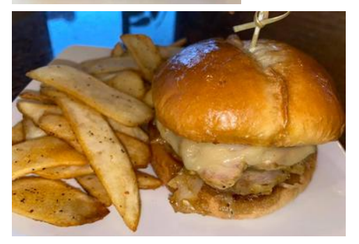
For more information, contact The Shore House Tavern at: