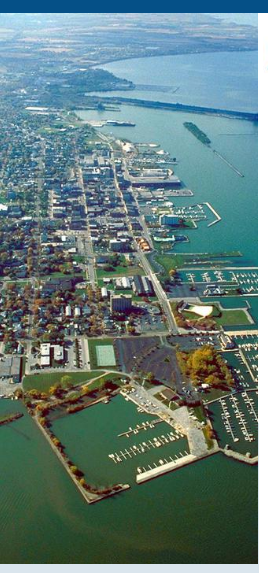
"SUCCESS IS NOT FINAL; FAILURE IS NOT FATAL: IT IS THE COURAGE TO CONTINUE THAT COUNTS." – WINSTON CHURCHILL