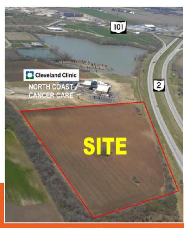
*Properties shown are owner/agent listing