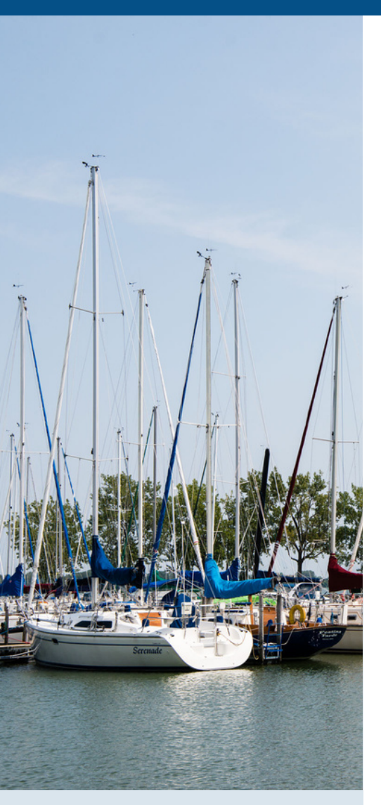
"SUCCESS IS THE SUM OF SMALL EFFORTS, REPEATED DAY IN & OUT." - R. COLLIER