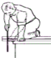
Crosscut Saw _____

7. The man below is cutting with a saw. At what angle is he cutting the wood at?