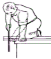
Rip Saw _____