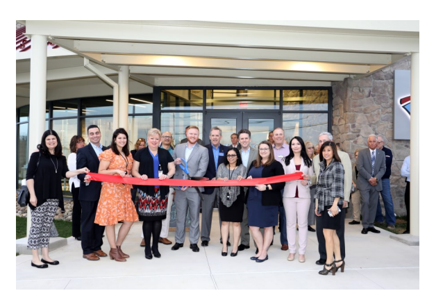
Citadel Federal Credit Union - Montgomeryville