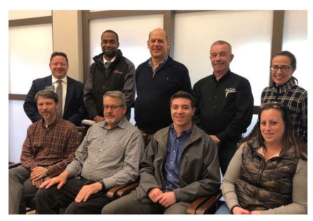
Meet the group members at bpnmontco.com

Our newest location: BPN - Fort Washington