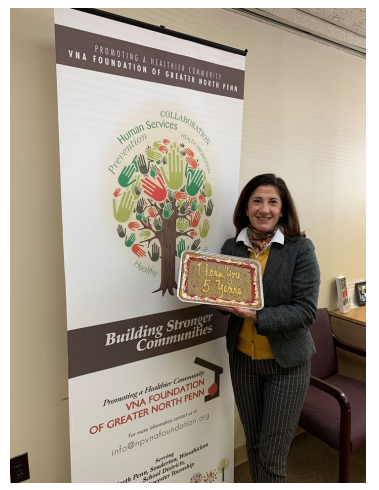
VNA Foundation - 5 years