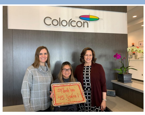
Colorcon - 45 years