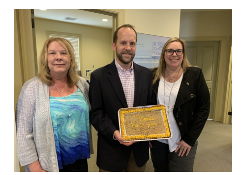
C&N Bank - 5 years