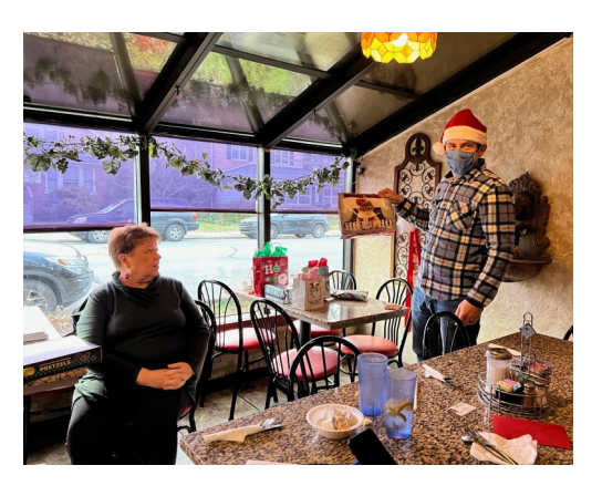
Lansdale Business Partnership Network (BPN)