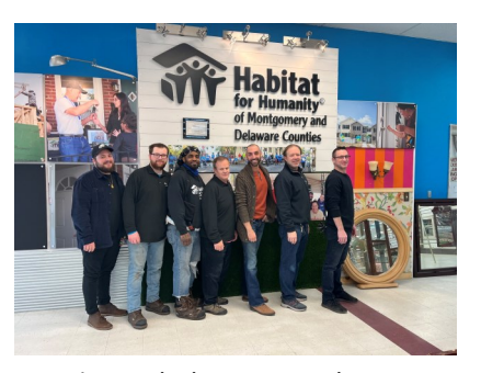
Visiting with the team at the amazing ReStore in Horsham