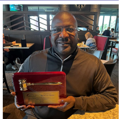
Celebrating six years of Board service including two years as Chair at Firebirds Wood Fired Grill