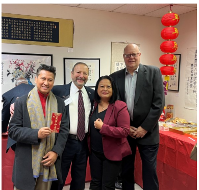
Celebrating the Lunar New Year