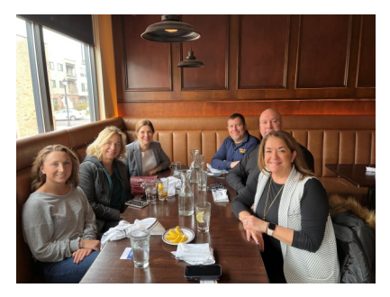
Having lunch with members at Stove & Tap