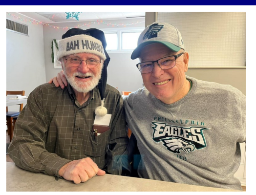
You never know who you will see at Tigers Family Restaurant