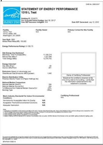
(Does not need to be stamped by an engineer.)