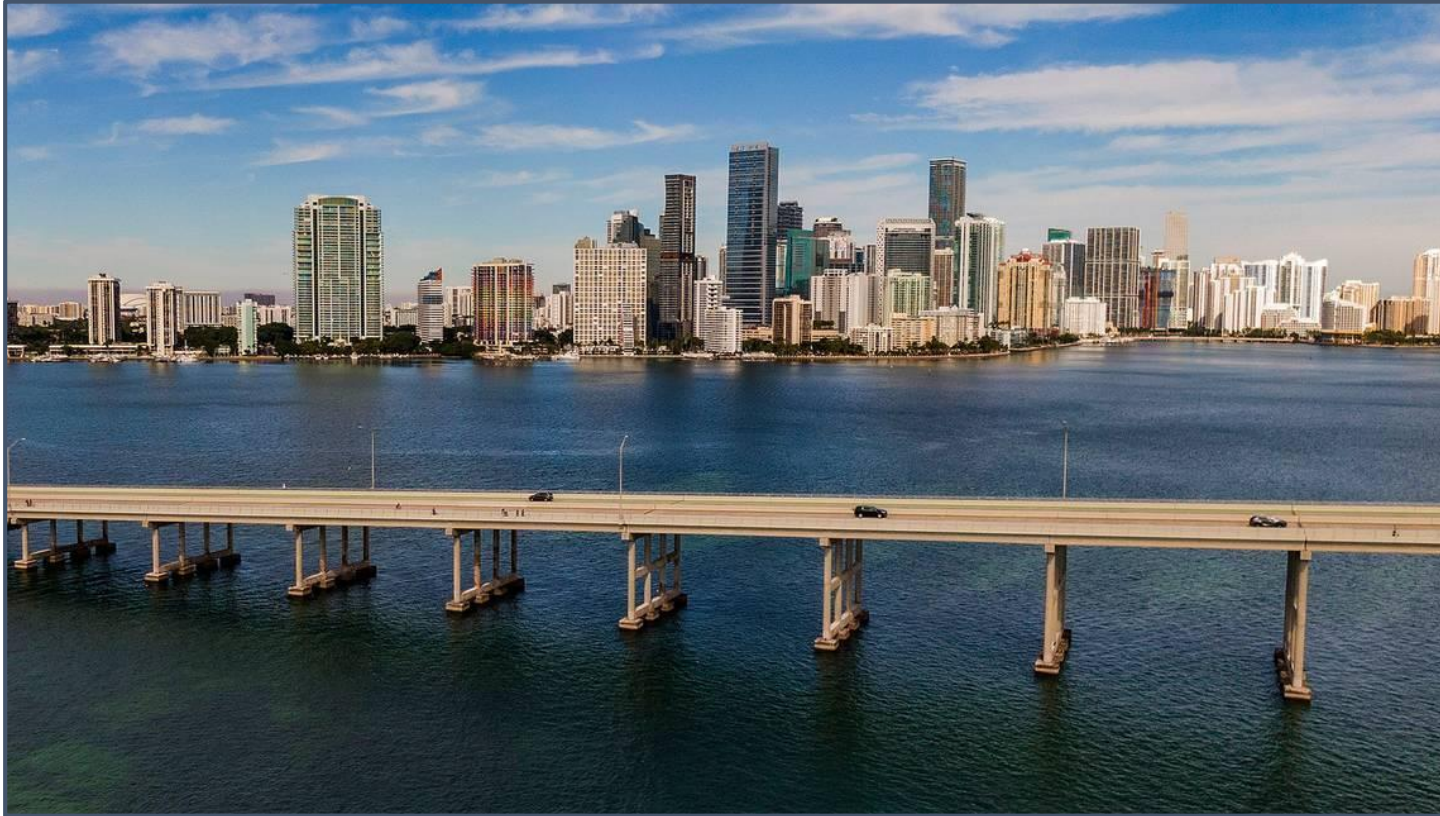
Renovations to the Rickenbacker Causeway