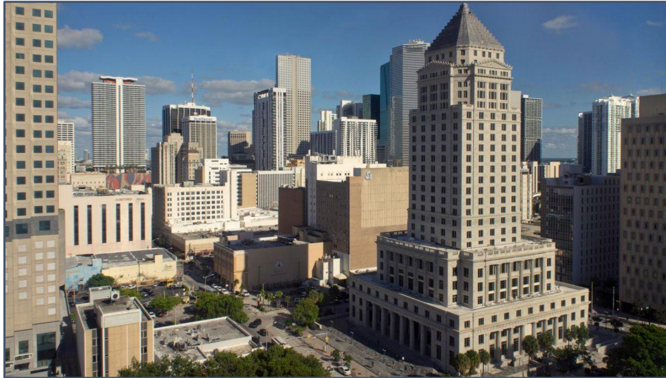
Design and Construction of Miami-Dade's Civil Courthouse