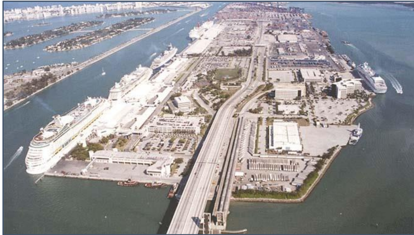
Design and Construction of the Port of Miami Tunnel