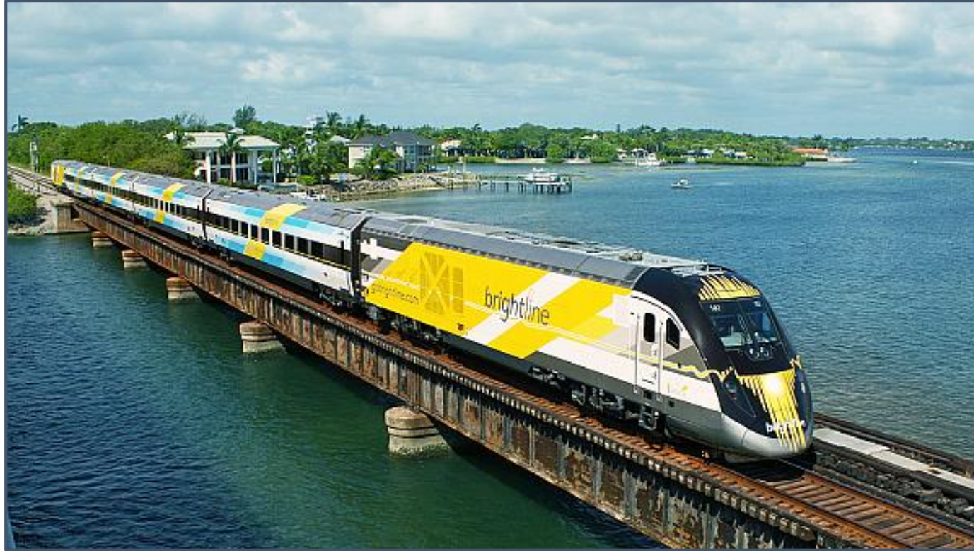
Florida Brightline Services