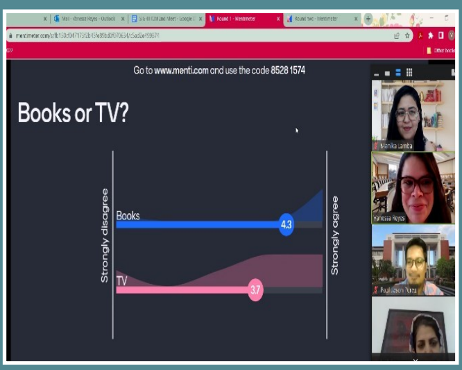
Photo: Interaction among participants from various session of SIG III Café International Meet

The initiative is a small beginning and the nature of participation among the members has already reflected the promise it holds. The team hopes to establish this event as a tradition in line with other long-running initiatives launched by SIG-III. Look out for more interesting themes for upcoming Café International Meets.