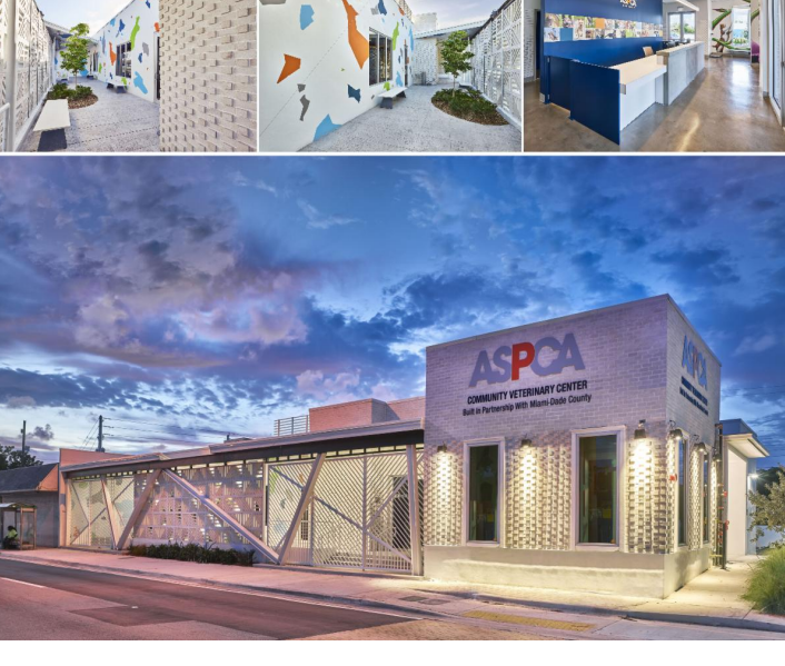
Inspirations Awards: ASPCA Community Veterinary Center

<u>TSAO Design Group</u> is proud and humbled to have received the Contract Magazine Inspirations Award for the design of the ASPCA Community Veterinary Center located in Liberty City in Miami. This project is the inspirational result of a successful partnership between the <u>American Society</u> for the Prevention of Cruelty to Animals (ASPCA) and <u>Miami-Dade County Animal Services Department (MDCASD)</u>.