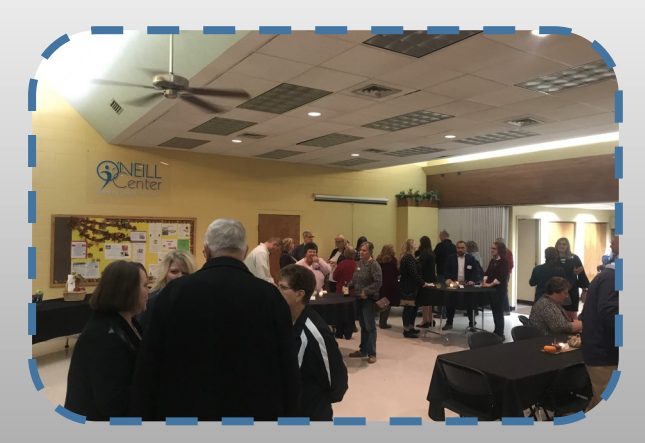
It was a full house in the at the O'Neill Center!