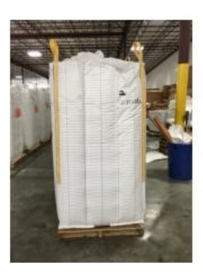
BAFFLE TYPE "C" FIBC