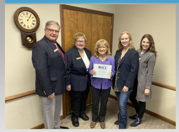
Marietta and Beyond