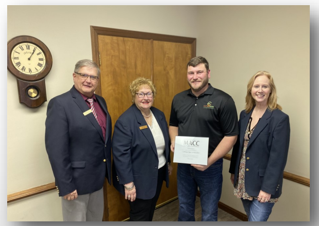
Cutting Edge Landscapes