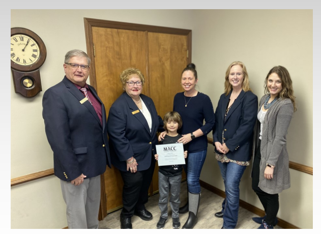
Little Black Dress Events