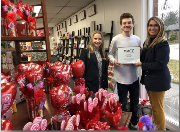
Gifts and More