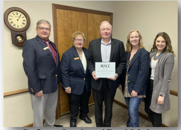
Confluence Security and Fraud Solutions