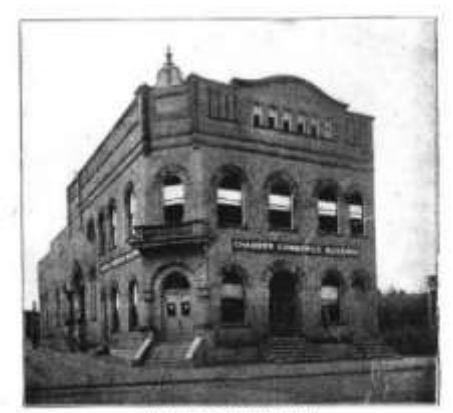
CHAMBER OF COMMERCE

The Board of Trade organized on April 30, 1887. On January 27, 1915, a general meeting of the Board of Trade, the Merchants Association and general business interests assembled for the purpose of organizing a chamber of commerce. On February 4. 1915 the Merchants Association agreed to merge by a small majority.