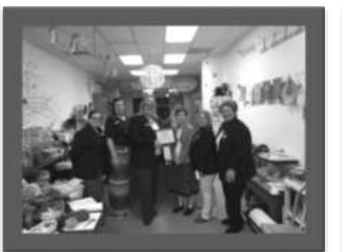
Peddler of Dreams Art Space