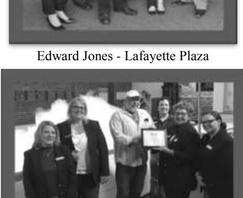
The Foam Garage