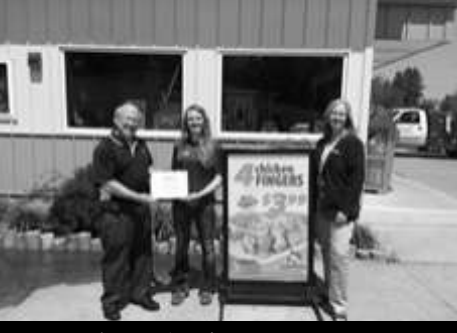
Millers AM/PM Marathon