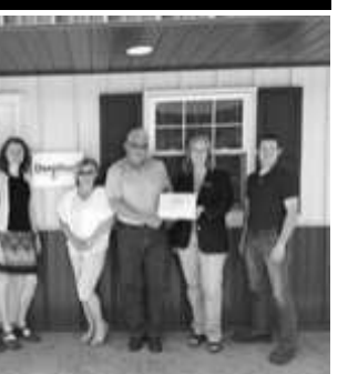
DeepRock Disposal Solutions