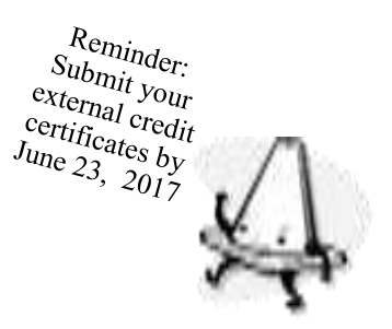
MOVSC Upcoming Meetings

2% should NOT be deducted from the premium payment! BWC will rebate the 2% back to employers by way of a policy credit.