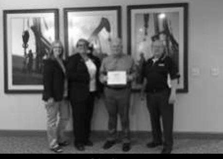
Artex Oil Company