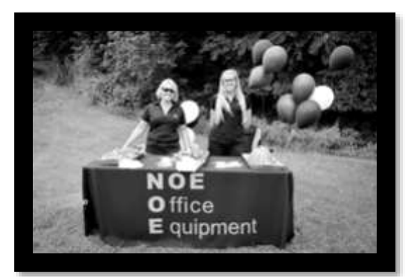
Special thanks to Noe Office Supply, Fairfield Inn and Suites and Comfort Suites for the "treats" around the course.