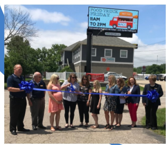
Rocket VII Interactive