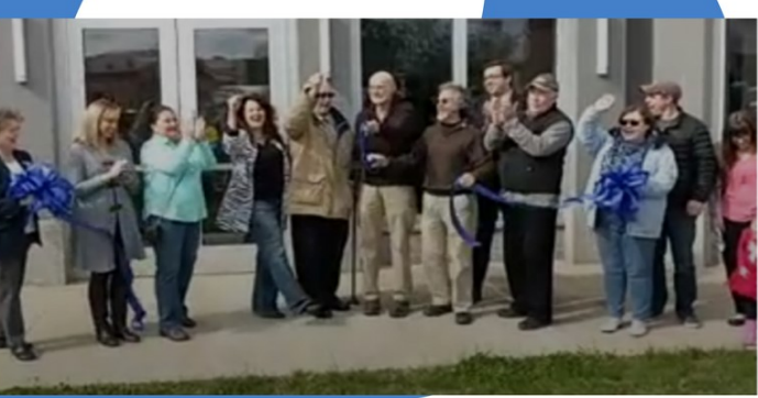
Pickering Energy Solutions