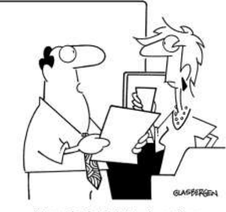
"We need to install better virus software. Another computer just filed a disability claim!"

Page 7 Marietta Area Chamber of Commerce