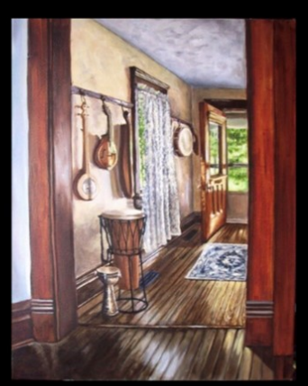
Featured Artist Bonie Bolen

Reservations are requested Chamber Members: $5, General Public: $10 (or those who wish to be billed) please call (740) 373-5176 for reservations